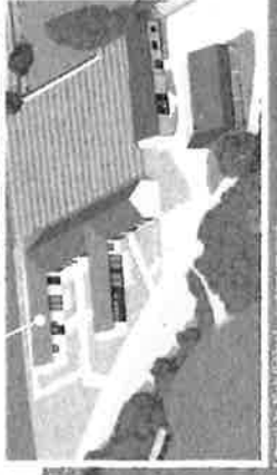
Manor Farm Student Accommodation 100m